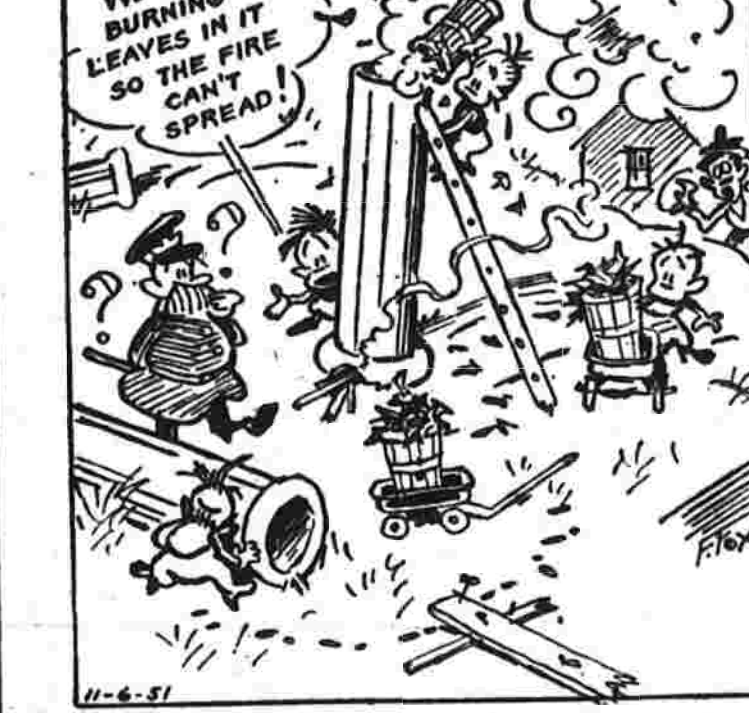
TRUENEVILLE POLKS BY FONTAINE FOX