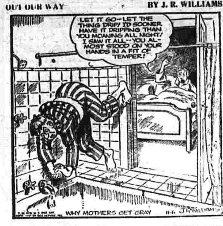
WHY MOTHERS GET GREAY